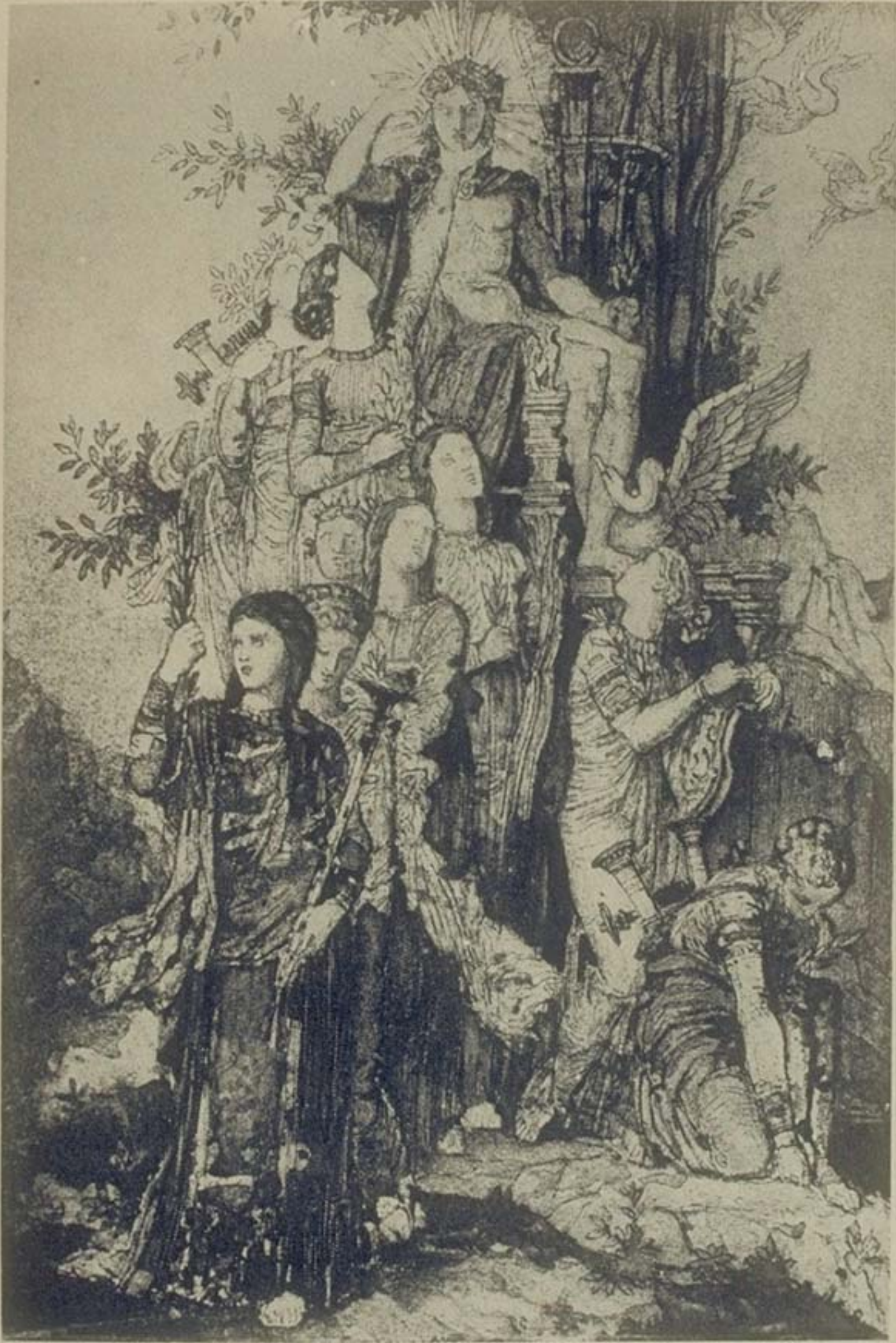
Gustave Moreau pinx.