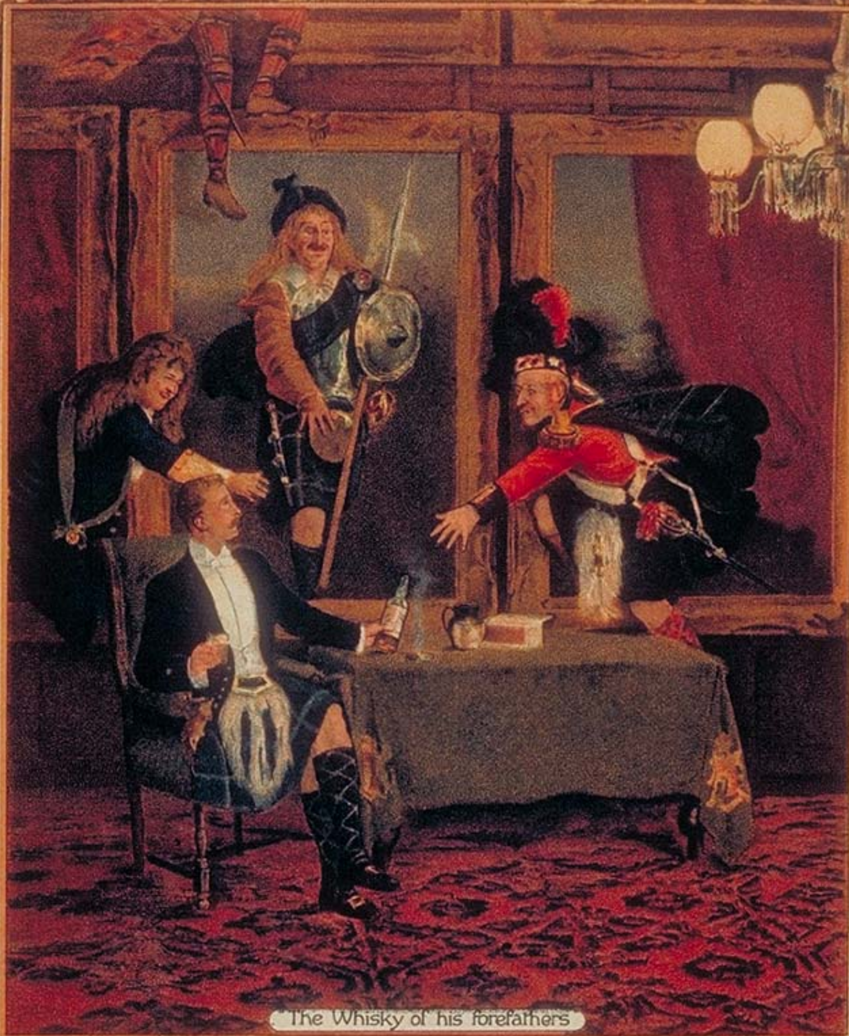
The Whisky of his forefathers

Sent free on receipt of 6d. in stamps. An unframed facsimile of the above picture, 15½ ins. by 13 ins., printed in 12 colours (one of the finest examples of English lithography) can be obtained of